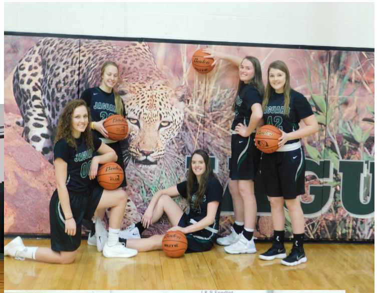
J & S Feedlot Country Treasures Cappellano Customs & Repair Aloys Transfer Inc.